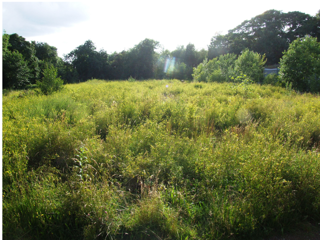
Carpet of Ribbed Melilot

Common Spotted Orchid were found this year and show that conditions are more favourable for them now that the meadow is being managed. The recently planted berry producing shrubs and trees: Rowan, Blackthorn, Guelder Rose, Pyracantha, Berberis, Dog Rose and Dogwood, were all surviving and many have fruited this