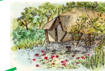
The Boat House