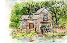
The Old Coach House