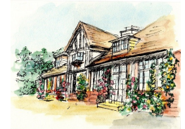
The Rose Garden Cafe