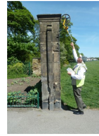
Measuring the North Entrance