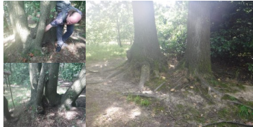
Evidence of coppicing in Cobnar Wood and Spring Wood