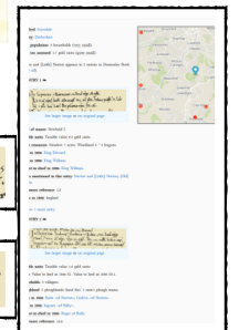
Translation of Domesday Book