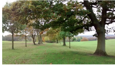
The Old London Road Looking North