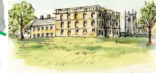
The Old Hall