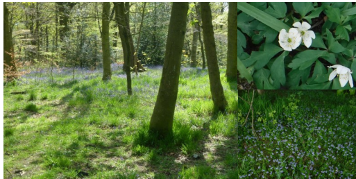
Ancient Woodland and Ancient Woodland Indicator Plants