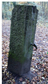
Gatepost on the Old London Road