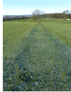
Boundary Marker Tree