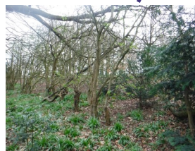
Old Boundary Hedge