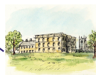
The Old Hall